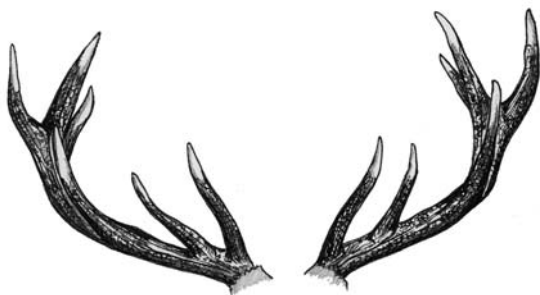
Red Deer antlers

Antlers are covered with a hairy skin or 'velvet' whilst they are growing. When they finish growing this dies and falls off.