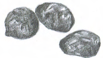
Brown Hare droppings (to scale)

Legs: powerful, long and slender. Has a loping gate.