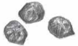
Rabbit droppings (to scale)

Legs: long legs and long hind feet, not as long and slender as the legs of the Brown Hare.